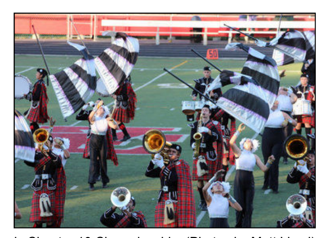
2012 Highlander Marching Band at the Tournament of Bands Chapter 10 Championship.